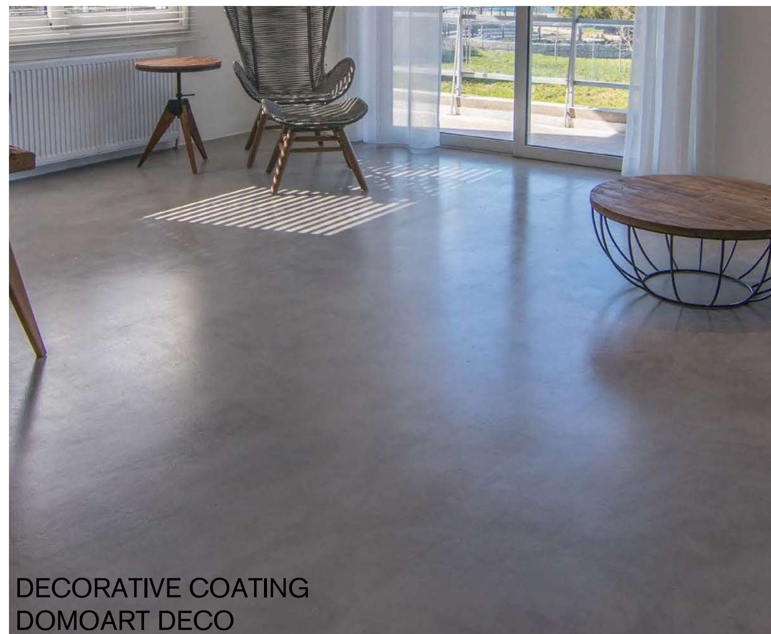
DECORATIVE COATING DOMOART DECO