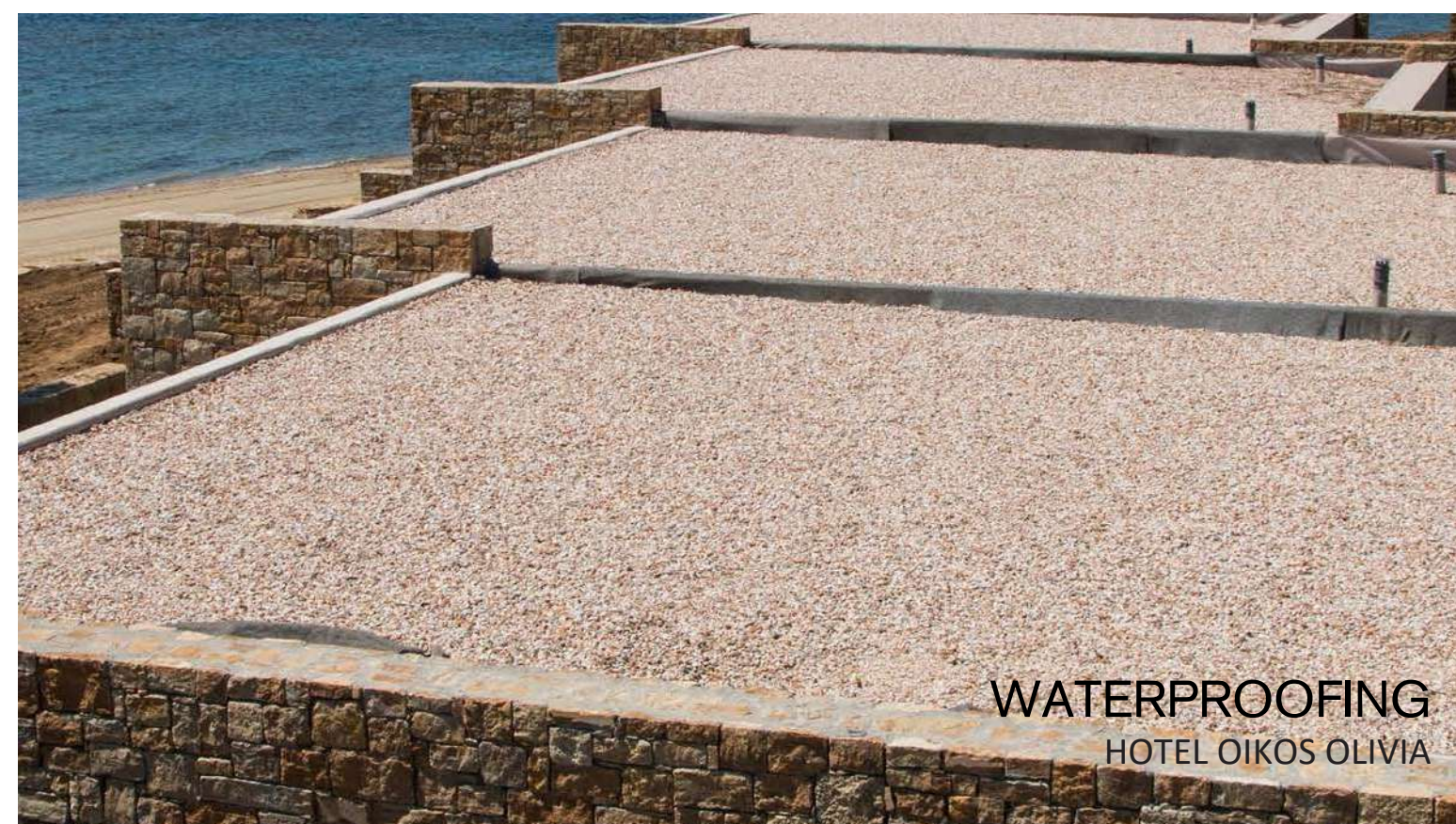
WATERPROOFING HOTEL OIKOS OLIVIA