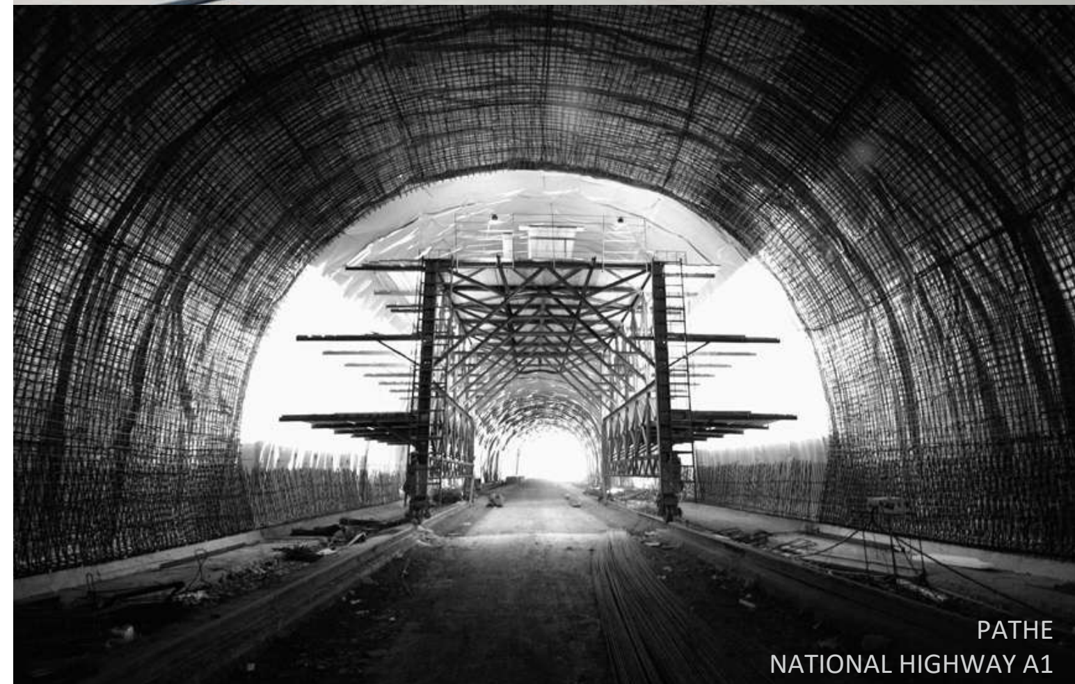
PATHE NATIONAL HIGHWAY A1